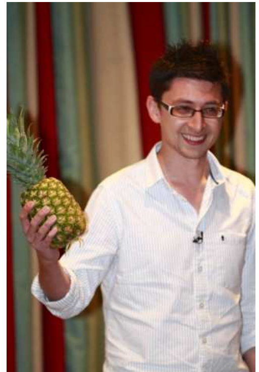
Comedy gets the prize