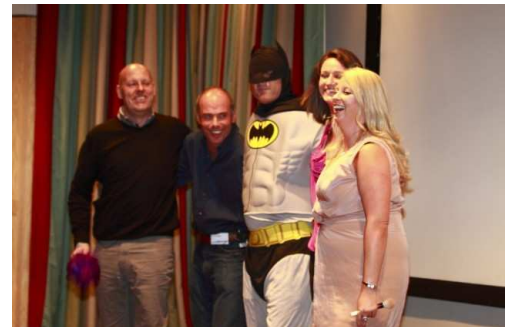
Taking a few personal risks breaks down the barriers and builds the team.

90% of the attendees described the event as excellent or good.