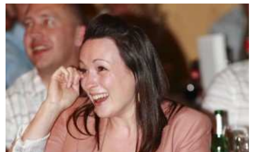
The final show was seriously funny

The workshop had to be completed in just 2½ hours followed by a final evening performance to an audience of 230 peers that would last 15 minutes. Naturally, being a comedy workshop, the final show had to be totally original and, of course, hilariously funny!